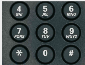
Imaging for characters Keystroke character check