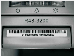
Imaging for characters Bar code reading